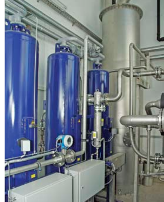
Combined CO 2 purification and drying unit (left), Stainless steel gas scrubber (right)

In the CO 2 -liquefaction plant, the dried and purified CO 2 -gas is cooled down to below -25°C and simultaneously liquefied. In our refrigeration plants we use screw or piston compressors for different refrigerants, e. g. NH 3 , R507 or R404a, depending on customer's request resp. case of application. For further increase of the CO 2 -purity and removal of residual O 2 (below 5 vpm) in the liquid CO 2 , there is the option of connecting a stripper system downstream the CO 2 -liquefier. The liquid CO 2 is finally stored in an insulated CO 2 -storage tank.