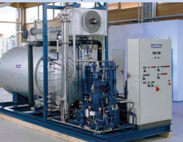
Compact CO 2 -Recovery Plant for 30 kg/h