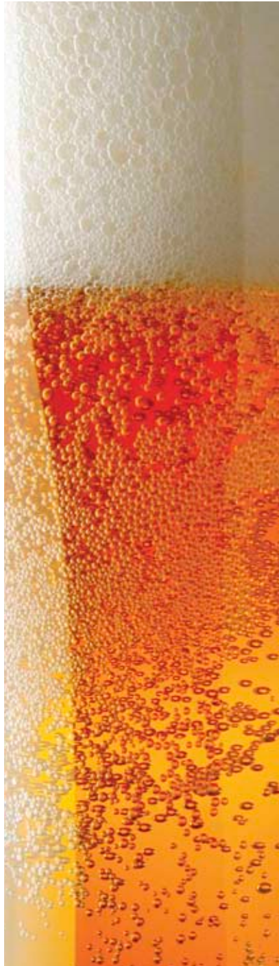
CO 2 - RECOVERY PLANTS FOR BREWERIES