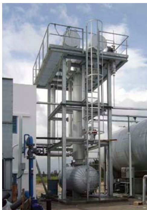
CO 2 -Stripper for highly pure CO 2